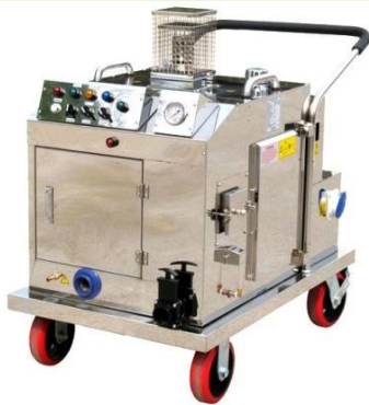
GUM REMOVER 207